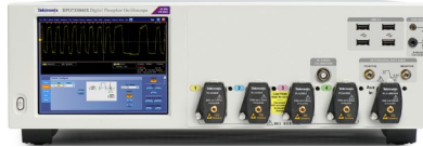
70KSX with TekConnect